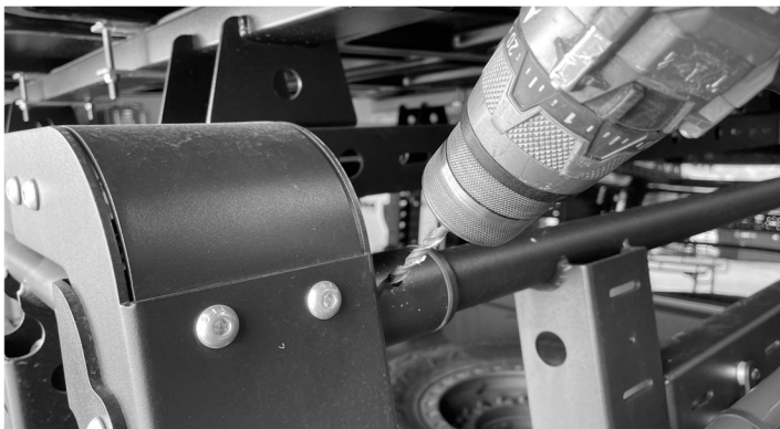
2. Drill a 3/16" pilot hole, then drill a 5/16" final hole as shown.