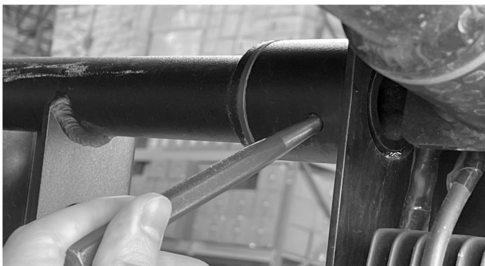
3. Repeat Step #1 on the reverse side of the shaft and mark the center of the locking pin hole.