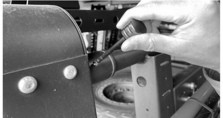
5. Using the provided lock key, unlock the lock assembly and slide the lock pin through the drilled holes.