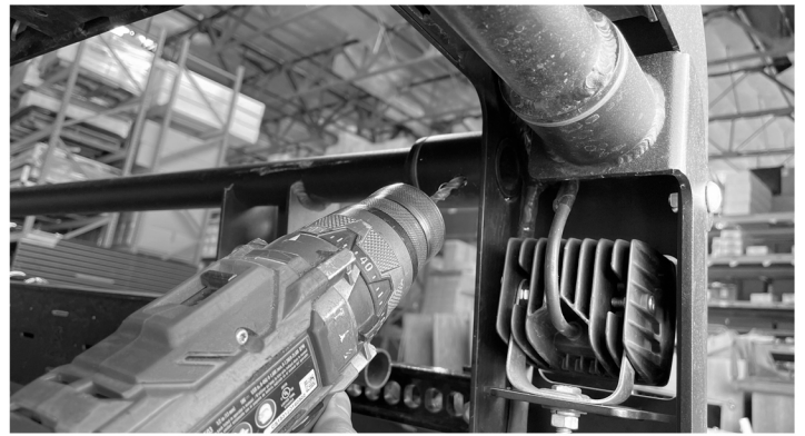
4. Drill a 3/16" pilot hole, then drill a 5/16" final hole as shown.

TOOLS 3/16" drill bit 5/16" drill bit Drill Center punch Hammer