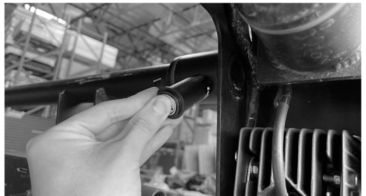
6. Place the lock body onto the lock pin and push the end of the lock in to latch closed.