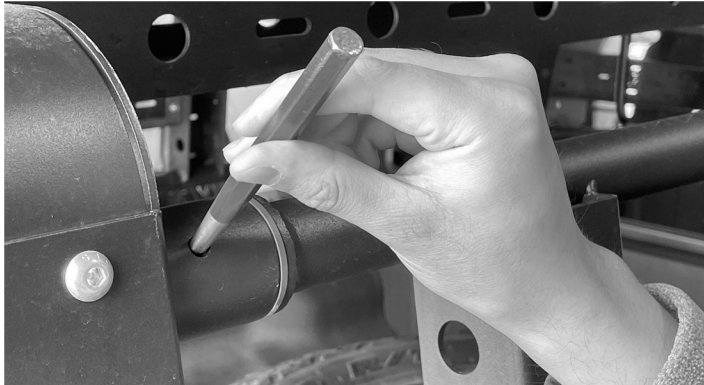
1. With the gate closed and both locking pins in place to secure the gate shut, mark the center of the locking pin hole through the collar as shown.