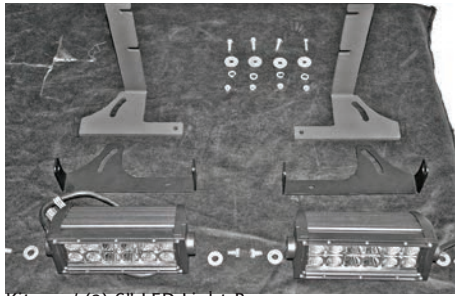
Kit - w/ (2) 6" LED Light Bars