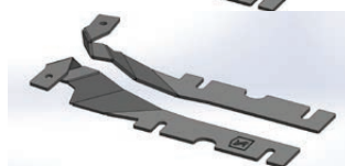
Mounting Brackets Only

* Simulated Rendering, NOT Actual Parts.