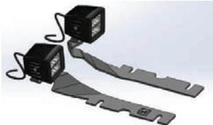
Kit - w/ (2) 3" LED Light Pods