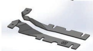
Mounting Brackets Only

* Simulated Rendering, NOT Actual Parts.