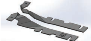
Mounting Brackets Only

* Simulated Rendering, NOT Actual Parts.