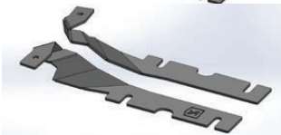
Mounting Brackets Only

* Simulated Rendering, NOT Actual Parts.