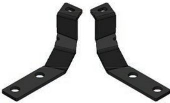
Mounting Brackets Only

* Simulated Rendering, NOT Actual Parts.