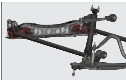
Highlighted: Torsion Bar Keys