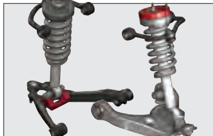
Highlighted: Lower and Upper Strut Spacers