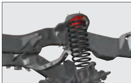
Highlighted: Upper Coil Spring Spacer