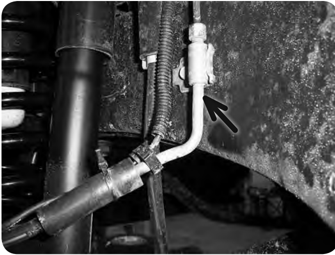
Figure 6B - After