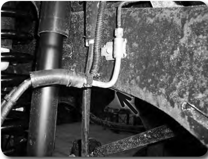
Figure 4b - Before

All model years: Check the slack in the brake lines by turning the wheels from lock-to-lock. It may be necessary to slightly reform the brake line hardline at the frame down about 10-15 degrees to provide more slack in the line Figure 4b/c . Carefully bend the hard line with your hands.