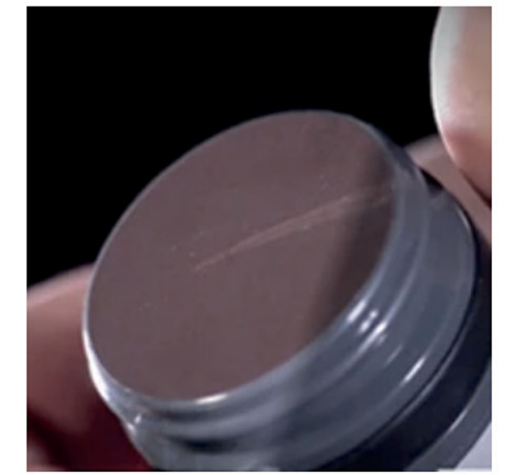
Sealed Strike Pad

Our water-resistant Typhoon Match Kit floats in water for extra peace of mind. An O-ring creates a waterproof seal that protects the 15 Typhoon Matches from moisture and keeps them dry.