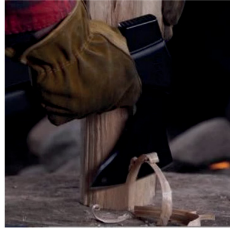
It shaves tinder

Chop small to medium fire wood with the 5 inch steel hatchet head.