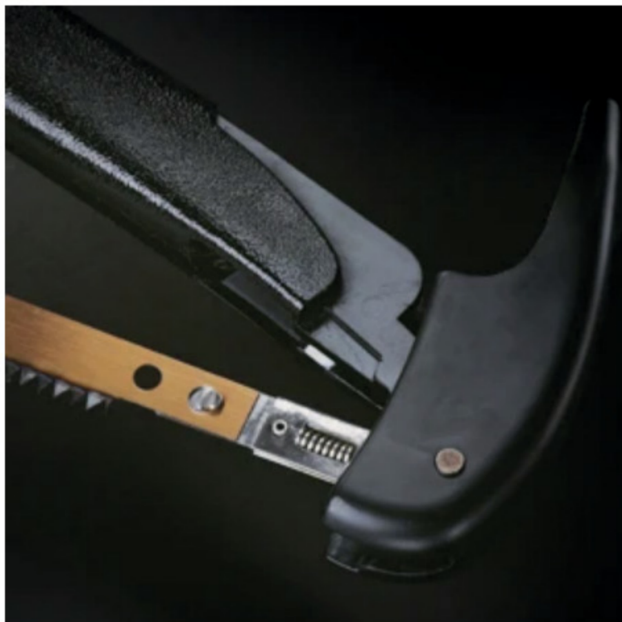
Snap Down Cam

Self-adjusting tension compensator keeps saw blade tight while sawing wood.