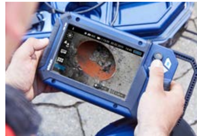
Razor sharp pictures in HD-quality, clear menu and comfortable to hold

The focus function via touch screen or joystick makes it possible to precisely control the depth of focus. A simple tip on the joystick ensures a precise, crystal clear image on the screen. Additional settings and extras, such as the touch screen keyboard, are accessible by tapping the touchscreen monitor.