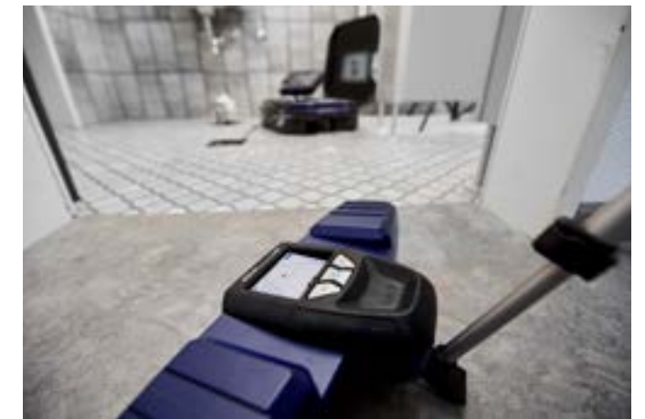
Precise location of the camera head with the Wöhler L 200 Locator, now with 512 kHz frequency