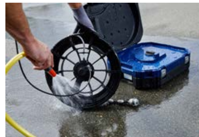
Fast cleaning for lasting hygiene: Simply splash the robust case and the viper with water