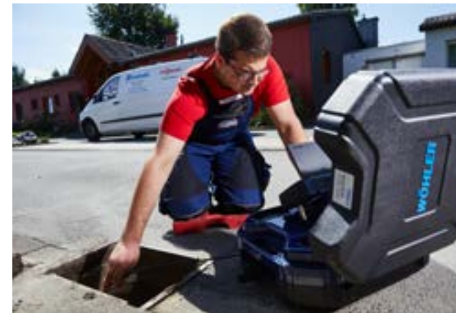
Secure drain inspection with the waterproof camera head