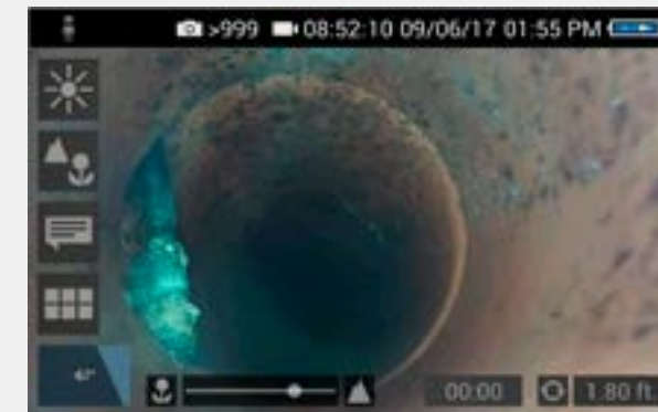
High Definition Display (Wohler VIS 700): razor sharp images