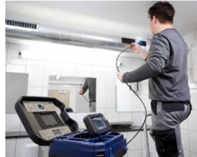
Easy inspection of ventilation systems with the 100 foot camera rod