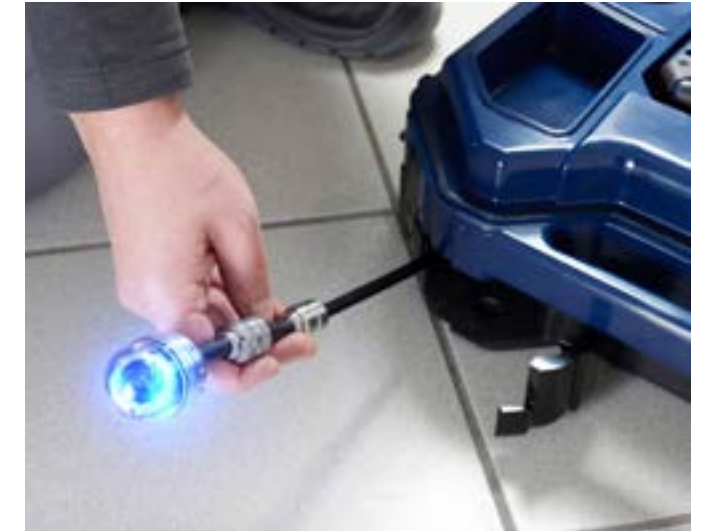
The 100 foot camera rod is at the same time flexible and durable because of its construction