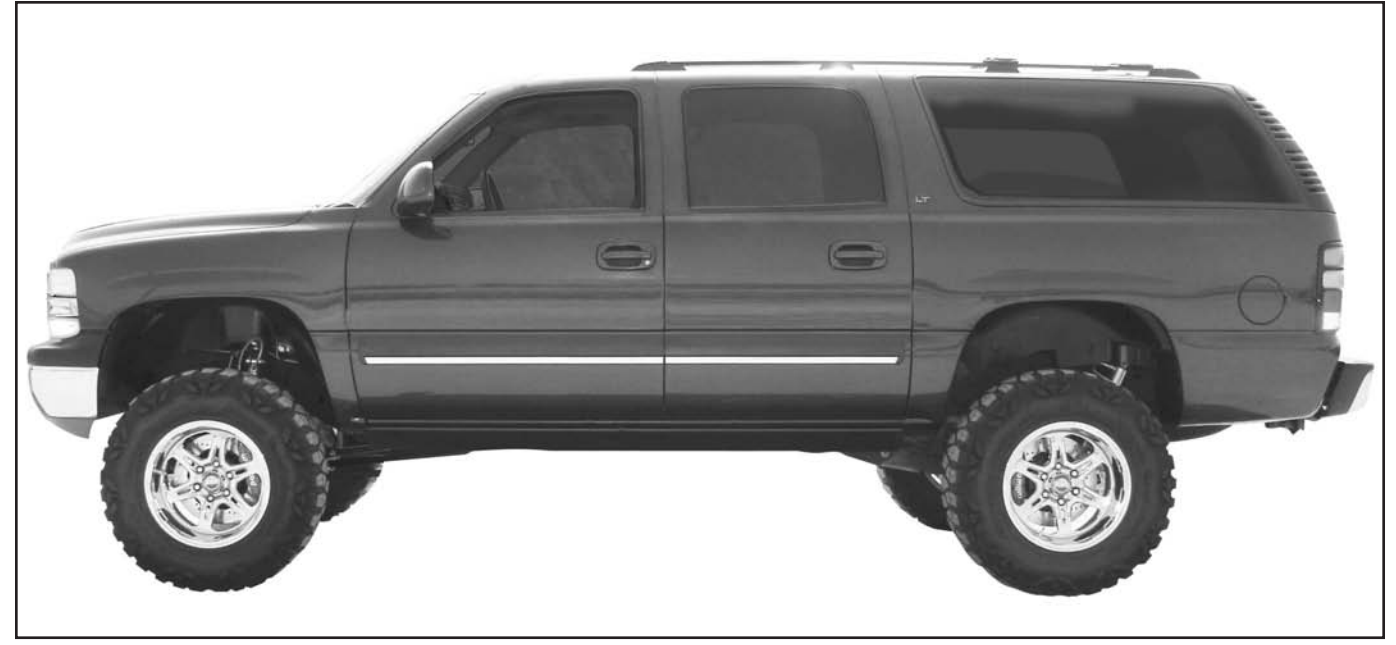
GM Truck / SUV 1500 Series Front / Rear Kit with SRP Rotor