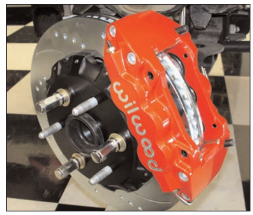
Wilwood Caliper Installation