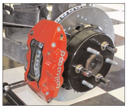
Wilwood Caliper Installation