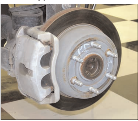
Removal of OEM Caliper