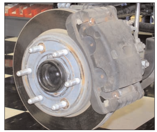
Removal of OEM Caliper