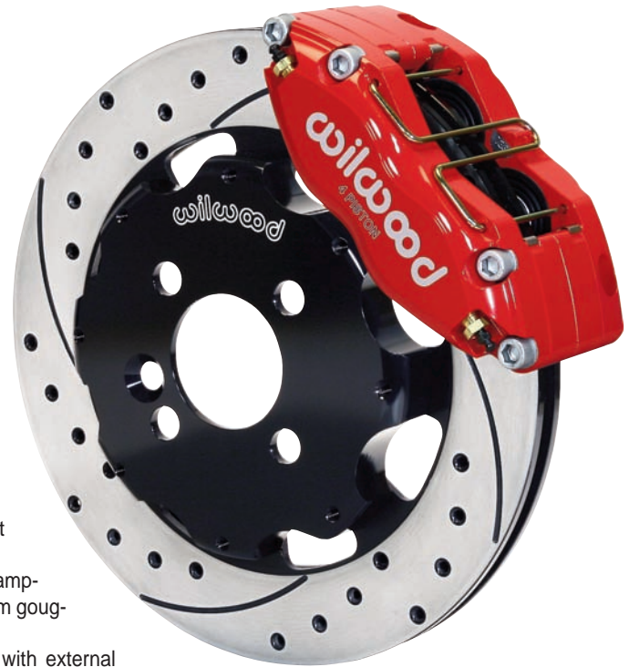
BMW Mini Cooper Big Brake Front Kit