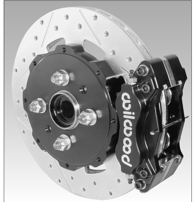
Typical Front Dynalite Big Brake Kit

Billet Dynalite Calipers This incredibly efficient structural design was developed using advanced solid modeling and stress simulation technology. Weighing in at only 2.7 lbs, the Billet Dynalite delivers powerful clamping force without body deflection and is the industry's lightest four piston racing caliper. Four large diameter 1.75" stainless steel pistons generate an awesome 4.8 line pressure to clamp force multiplier, are corrosion resistant, have long wear and smooth operation in the bores. Stainless pistons transfer less heat than aluminum designs and reduce the risk of pedal fade from fluid boiling. Cooler caliper temperatures also prevent bore scuffing and piston binding caused by excessive heat distortion. Internal fluid ports eliminate all potential problems associated with external tubes and four corner vertical bleeders allow total evacuation from both sides, regardless of mounting position. A high luster black anodized finish accelerates heat dissipation and preserves this caliper's classic good looks year after year.