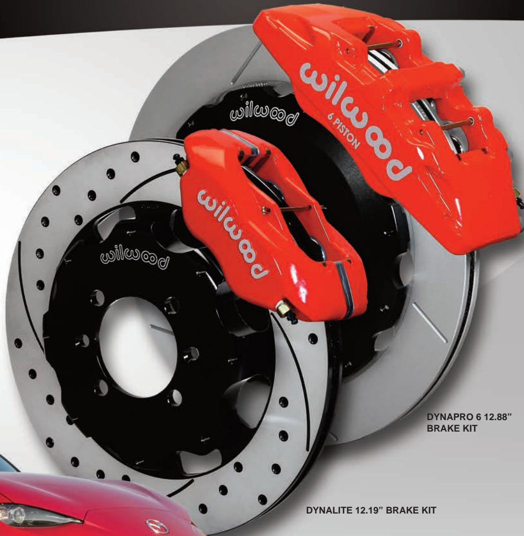
DYNAPRO 6 12.88" BRAKE KIT