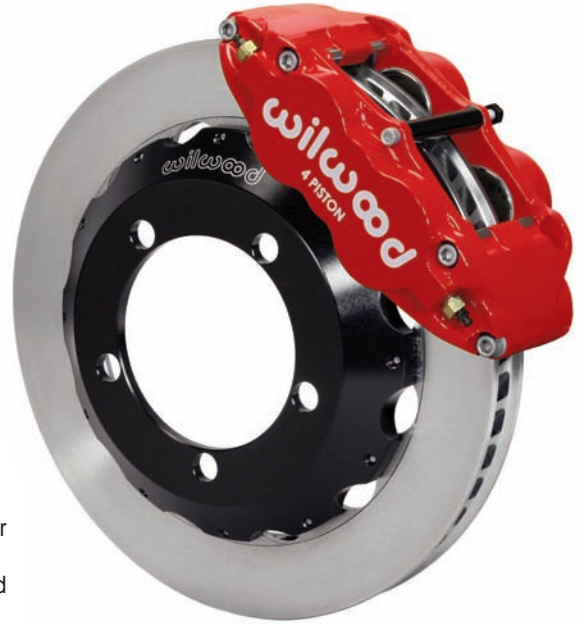
FNLS4R HD Kit Assembly