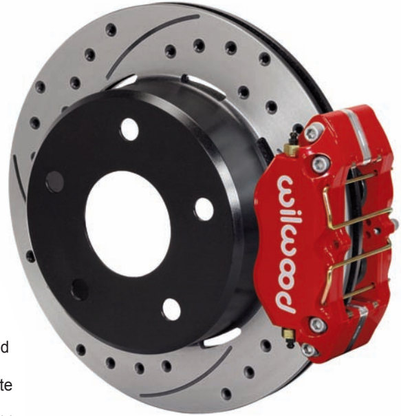
DynaPro Kit Assembly