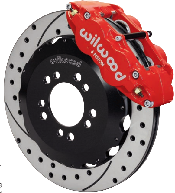
FNSSL6R Kit Assembly, 12.88" Shown