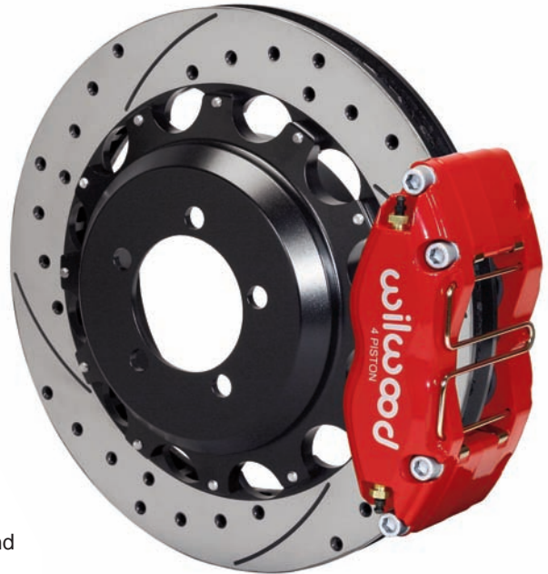
Rear Kit Assembly Shown with Red Caliper and SRP Rotor