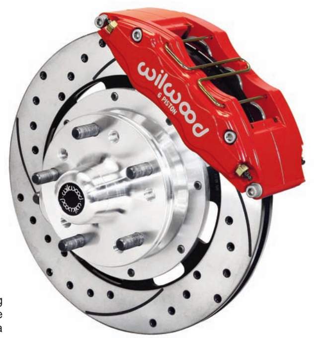
Front Kit with SRP Rotor and Red Caliper