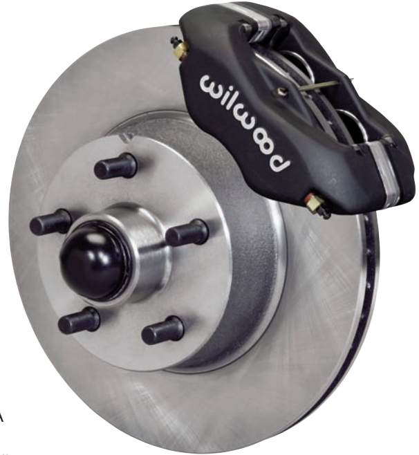
Front Dynalite Classic Series Kit