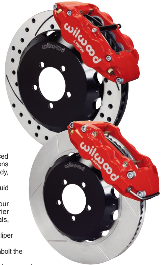
FNSL6R Front Kit Assembly (top)