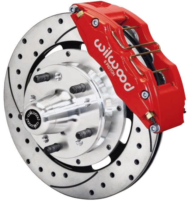
Front Kit with SRP Rotor and Red Caliper