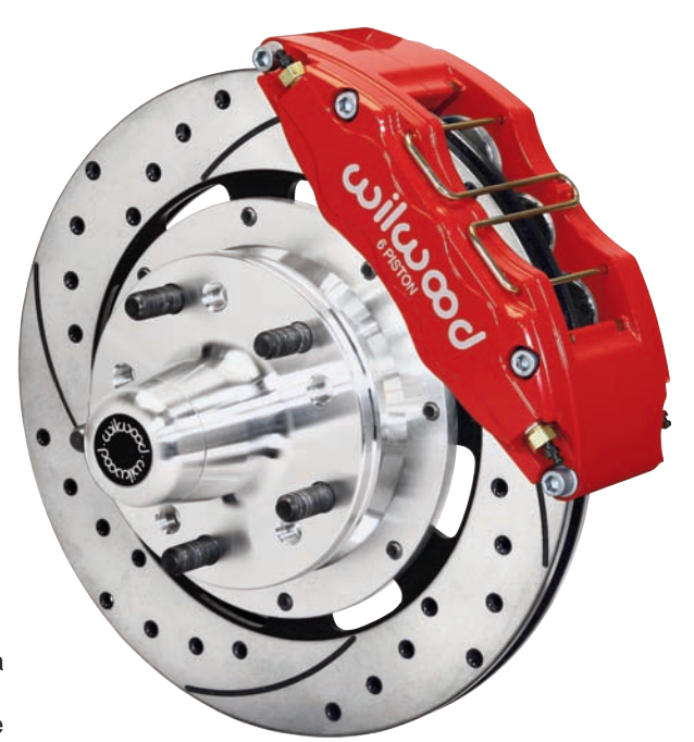
Front Kit with SRP Rotor and Red Caliper