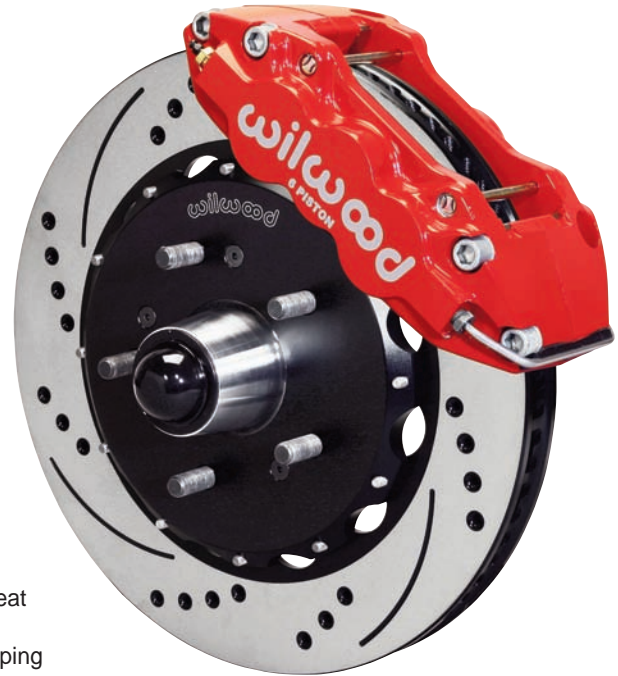
Big Brake Front Kit Assembly with Red Caliper and SRP Rotor