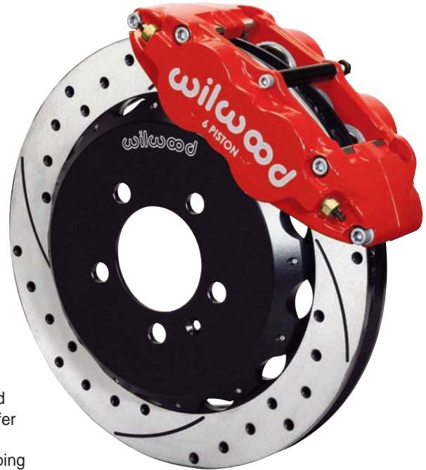
Big Brake Front Kit Assembly with Red Caliper and SRP Rotor