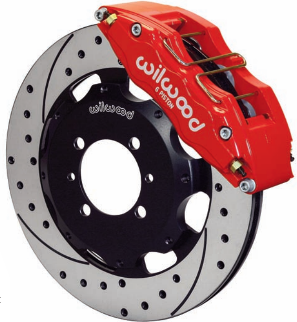
Front Kit with SRP Rotor and Red Caliper