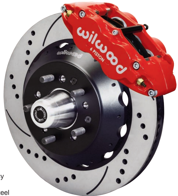
Big Brake Front Kit with SRP Rotor and Red Caliper