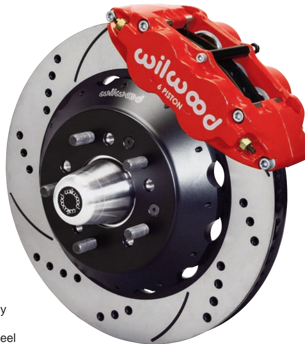
Big Brake Front Kit with SRP Rotor and Red Caliper