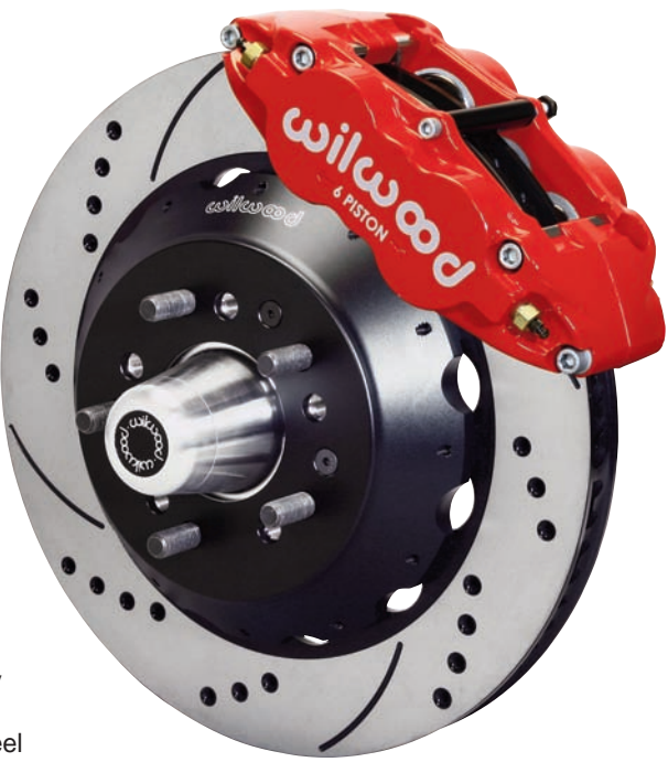
Big Brake Front Kit with SRP Rotor and Red Caliper