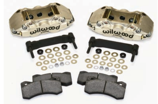
W6AR Caliper and Bracket Upgrade Kit (Calipers Shown in "Quick-Silver" Finish)