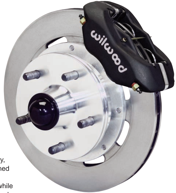
Front Dynalite Classic Series Kit