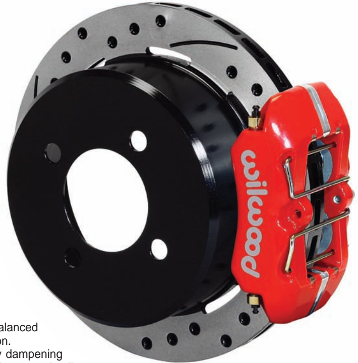
Rear Parking Brake Kit with Red Caliper and SRP Rotor