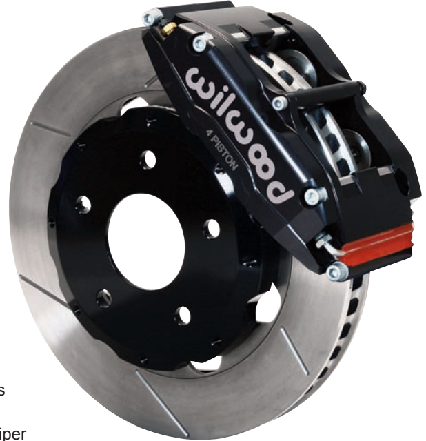
Big Brake Front Kit with GT Rotor