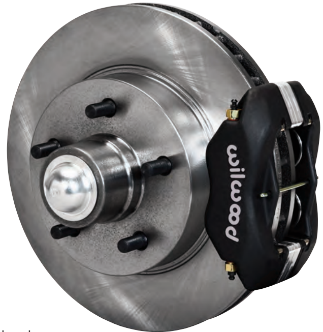
Front Kit Assembly