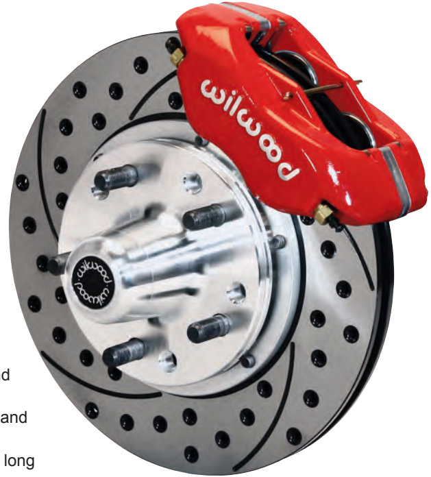
Heidts Pro Series Front Kit with SRP Rotor and Red Caliper