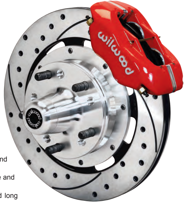
G Body Pro Series Front Kit with SRP Rotor and Red Caliper