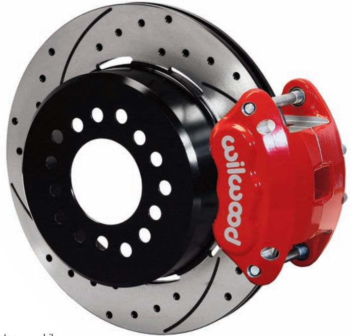
Rear Parking Brake Kit with Optional Red Caliper and SRP Rotor