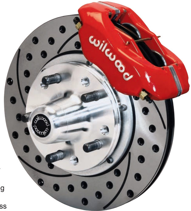
Pro Series Front Kit with SRP Rotor and Red Caliper