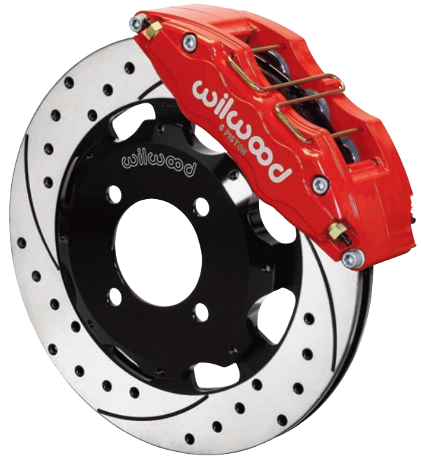
Front Kit with SRP Rotor and Red Caliper