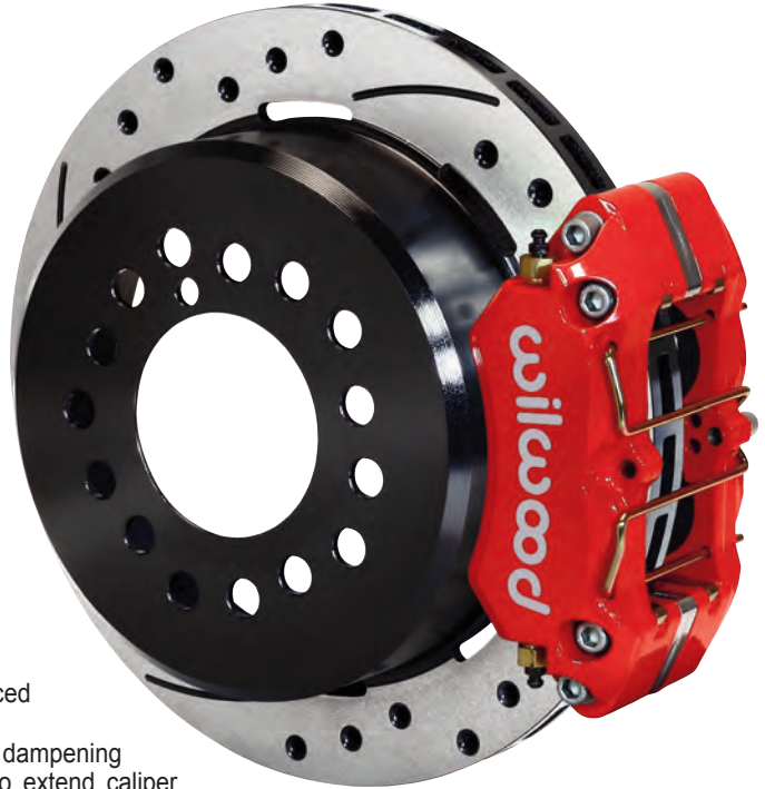
Rear Parking Brake Kit with Optional SRP Rotor and Red Caliper

Please check the diagram on the back of this page for minimum inside wheel clearance requirements