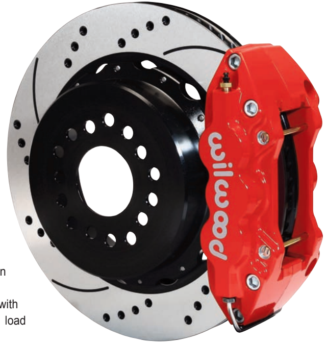
Camaro Big Brake Rear Kit with SRP Rotor and Red Caliper