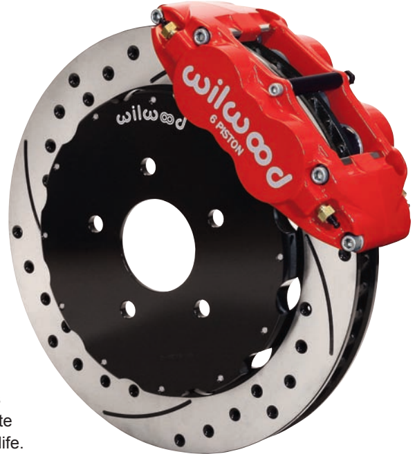
Corvette C-3 Big Brake Front Kit with SRP Rotor

Optional stainless steel flex ines with machine crimped ends, include the fittings necessary to connect the calipers with the OE brake line fittings at the chassis. Flex lines kits must be ordered separately.