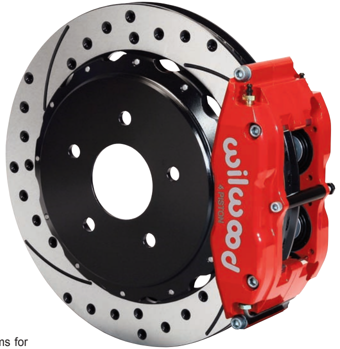
Corvette C-3 Big Brake Rear Kit with SRP Rotors

Use Wilwood's DOT approved stainless steel flexline kits for better pedal feel and improved performance. These #3 stainless steel reinforced braided lines provide a firmer, more consistent, faster responding pedal by minimizing compliance and volume displacement within the system. Kits include all fittings to connect the hose to the bulkhead brake line and the caliper. Flexline kits are sold in pairs for either front or rear and must be ordered separately.