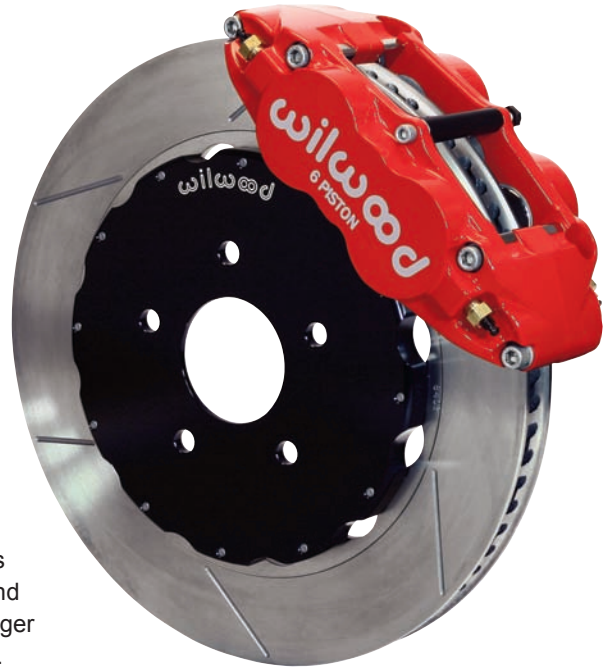
Big Brake Front Kit with GT Rotor and Red Caliper

This 6-piston radial mount caliper is FEA computer designed using the latest in solid modeling and stress analysis technology. CNC machined from high strength billet, the FNSL6R caliper has been proven in competition and many sports driving applications. The unique 6-piston differential bore design provides balanced pad loading for even wear extending pad and rotor life. Six stainless steel pistons are employed to combat heat transfer. Five high strength steel bridge bolts produce high clamping efficiency without deflection or separation under severe load. Wilwood's replaceable SRS bridge plates dampen harmonic vibrations and eliminate bridge wear caused by the pad gauging, promoting longer caliper life. Calipers come in Wilwood red or black powder coat finish.