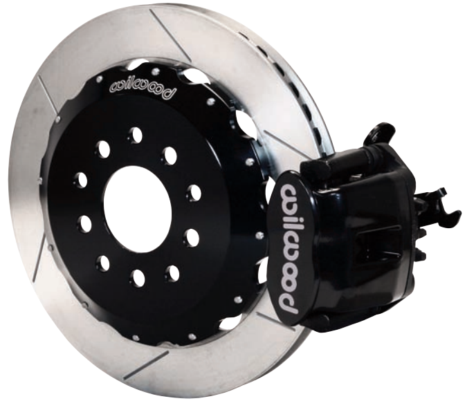
Honda S2000 Big Brake Rear Kit with GT Rotors

Single piston floating mount calipers are securely attached to the axle with a fixed radial mount bracket on the axle. The floating mount caliper maintains perfect alignment when the cable actuated mechanical parking brake lock is engaged and then released. Correct alignment is maintained over the disc as the pads wear and pad knock back is minimized. Radial mounting provides secure attachment to the axle housing end and precise adjustments for pad to rotor alignment. The cable actuated parking brake is easily adapted to the original cable system. Cables for aftermarket hand brake lever kits are easily configured for custom fabricated installations.