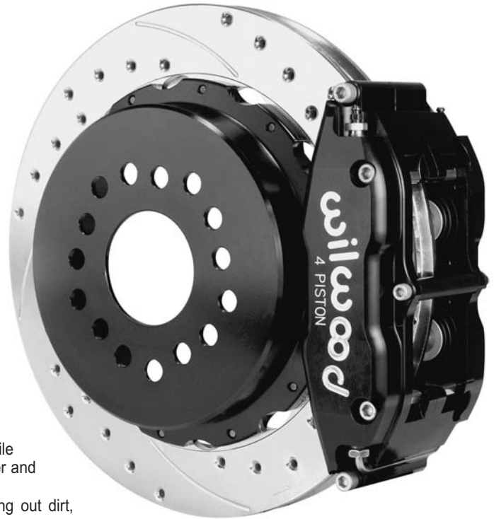
Rear Parking Brake Kit with SRP Rotor