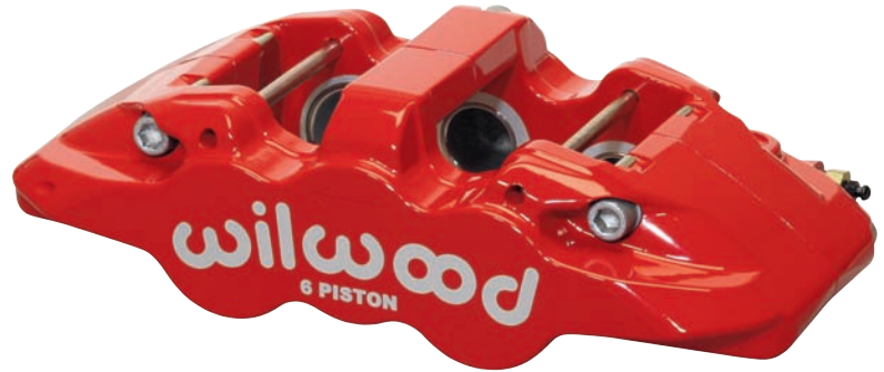
Aerolite 6R Caliper Shown in Red

The new Aerolite 4 and 6 piston radial mount calipers from Wilwood deliver state of the art forged caliper technology, with performance options covering all types of custom and competition braking requirements for road and track. Aerolite calipers are available with several options for piston sizes covering all types of applications from OE booster and master cylinder equipped cars with ABS, to purpose built custom and race vehicles with manual twin or tandem master cylinders.