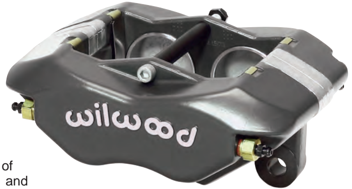
■ Black Anodize

FNDL calipers are a direct replacement for all previous Wilwood NDL's and similar competitive brands with 3.50" centered mounting tabs. A total of five bolts provide superior bridge strength and positive retention of the top loaded 7816 or 7216 type brake pads. The full range of PolyMatrix pad compounds are available to match the brake response and heat range requirements of any competition application.